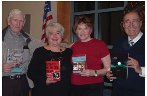
“So You Want to Write a Book” author panel