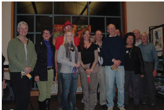
Artists honored at Creekside Festival opening reception

The annual Creekside Arts Festival raised $1,600 for library support.