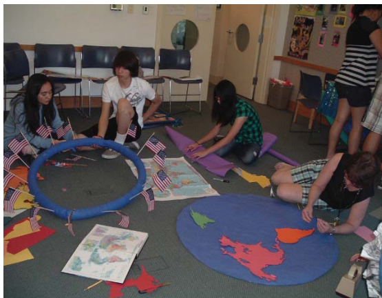
Volunteers working on July 4th parade float