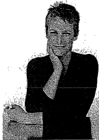
Actress and best-selling children's author, Jamie Lee Curtis, will speak at CLA's Annual Membership Meeting on October 27, 2007

Conference housing is now open. The California Library Association has negotiated for a limited number of discounted hotel rooms in Long Beach for conference attendees. We encourage you to make your hotel reservations early, as many hotels will sell out before the conference. Hotel reservations may be made online or by calling 1-800-243-1197.